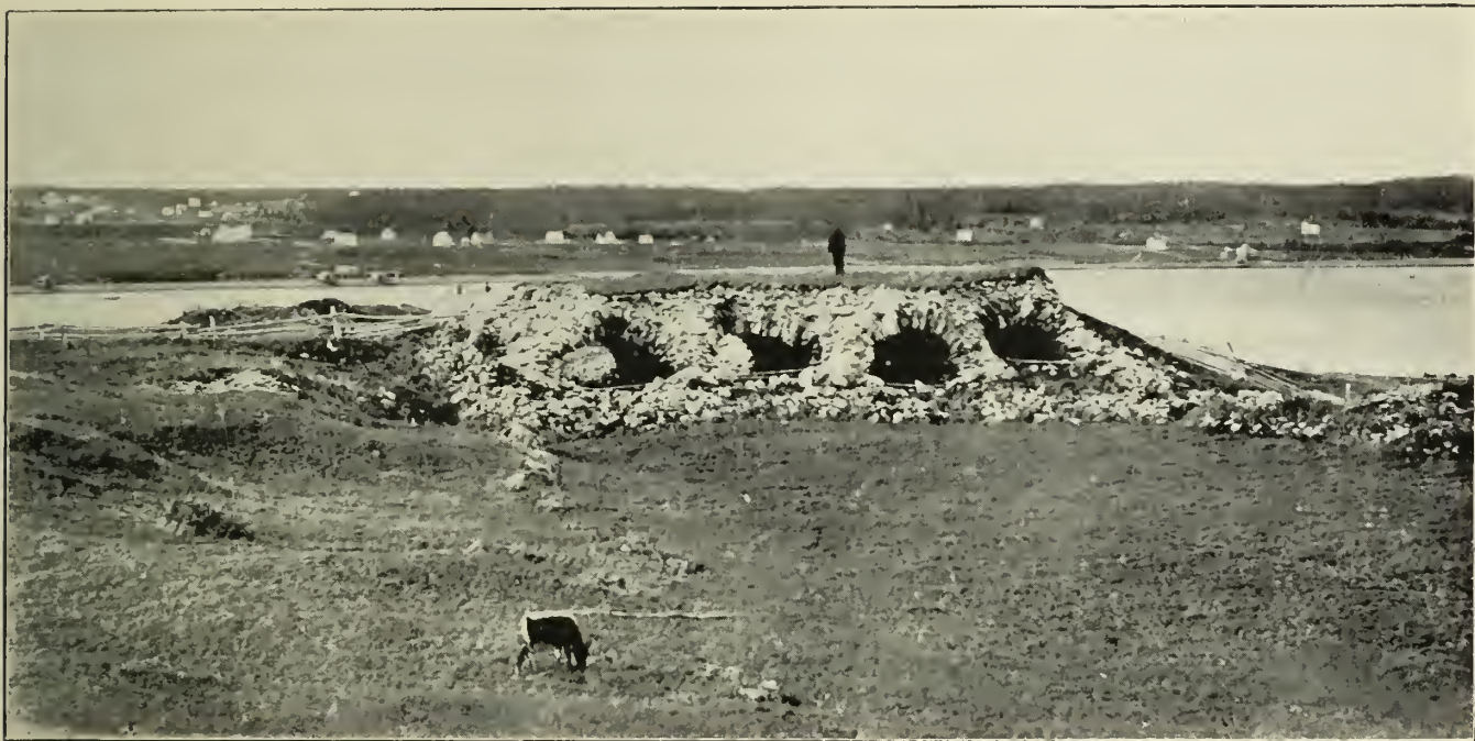
THE LAST OF LOUISBURG.

Sydney, in which a syndicate of English capitalists are deeply interested. Cape Breton certainly offers exceptional advantages as an iron producing and manufacturing centre, with abundant coal right at hand, the ore to be got from Newfoundland without railway carriage, and with admirable shipping facilities to reach the world's markets.